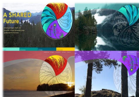
The new layout of the A SHARED Future website. Visit us at www.asharedfuture.ca