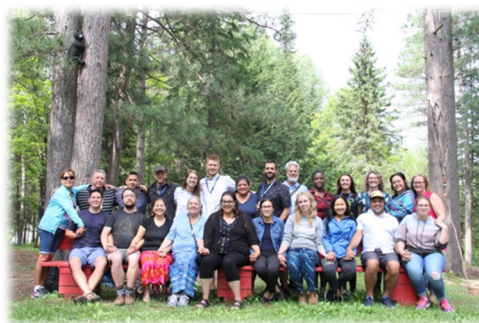
The 2018 Summer Institute Attendees