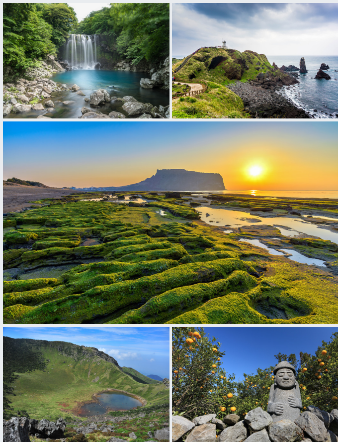
The 19th International Conference of the Pacific Basin Consortium for Environment and Health (PBC) Hosted by IERI, GIST